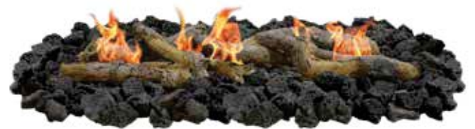
*LAVA ROCK NOT INCLUDED