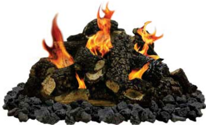
*LAVA ROCK NOT INCLUDED