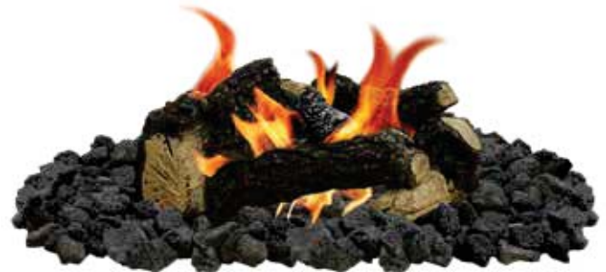
*LAVA ROCK NOT INCLUDED