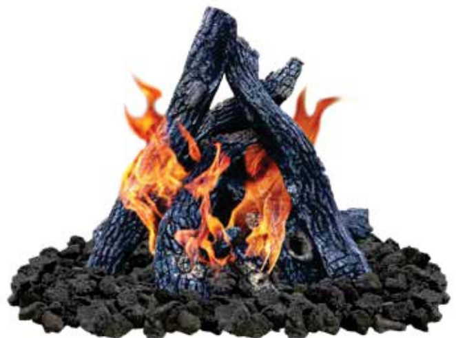
*LAVA ROCK NOT INCLUDED